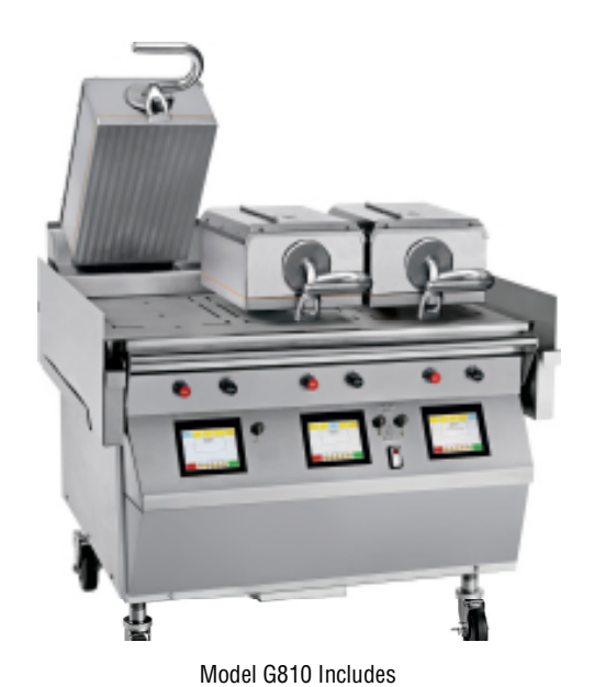
grooved upper platen.